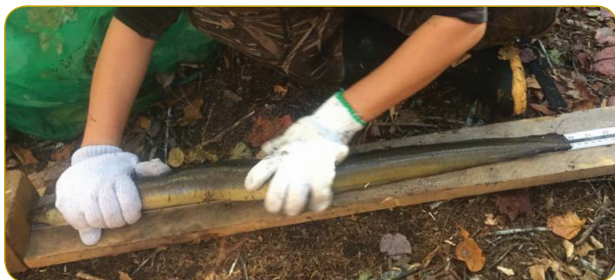
Blaire measures an American eel for length at the recapture trap.

downstream in the recapture site. Lengths were measured of all tagged eels, and colour, or phase, was recorded as either yellow, silvering, or silver. Most of the eel were silver (sexually mature eel migrating to the ocean to spawn).