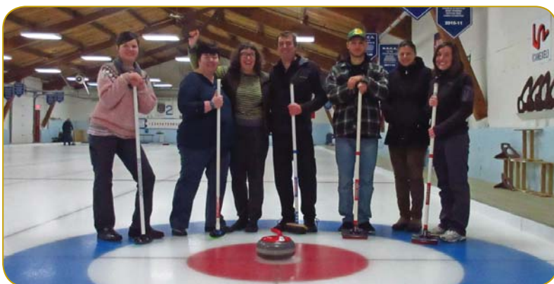
Coastal Action staff at Chester Curling Club for January's Staff Day.

Profile: Scotia-Fundy Elver Advisory Committee Page 4