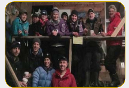
Top: Elvers captured in a net for measuring, before being released upstream. Bottom: Licence holders and employees of our local elver fishery.