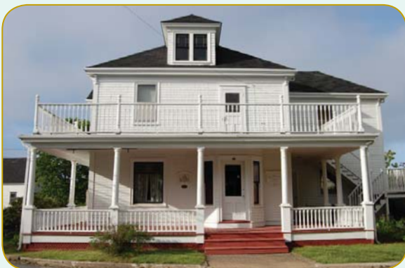
Our home: Captain Angus Walters House in Lunenburg.

If you'd like to read further, in-depth information regarding the stories highlighted in this issue, please visit our website ( www.coastalaction.org ) where we post more detailed updates on all of our projects. We have lots on the go here at Coastal Action: research, education and outreach, public engagement activities, and volunteer opportunities. If you'd like to see a report on one of our projects or events in the Coastal Chronicle , send us an email at editor@coastalaction.org .