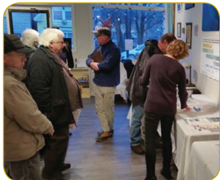
Visitors at Art Happening, browsing information about marine protected areas.

Coastal Action collaborated on a Fisheries and Oceans Canada-hosted Marine Protected Area public session at Art Happening Bridgewater, on December 7, 2016. Information on the general framework of marine protected area planning on Nova Scotia and the Bay of Fundy coasts was provided, questions from attendees were answered, and feedback was gathered about