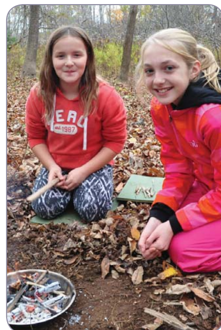
Trailblazers participants learning how to build a Leave-No-Trace fire.

Coastal Action started running Trailblazers in spring 2016 and we now offer spring and fall sessions at two schools in Lunenburg County. The program has been met with great success and enthusiasm by kids, parents, and schools. We hope that Trailblazers will inspire Lunenburg County youth to pursue their own outdoor adventures in NS and beyond!